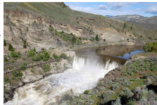
Enloe Dam and Similkameen River near Oroville, Wash.