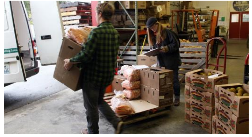
PUGET SOUND FOOD HUB'S SKAGIT COUNTY AGGREGATION AND DISTRIBUTION SITE

Planners play a role in shaping economic conditions and opportunities through removing regulatory barriers, implementing supportive land use policies, and creation of revitalization and incentive programs. Planners can also be partners in public/private projects such as food business incubators, public markets, food hubs, local purchasing campaigns, and food-based neighborhood revitalization