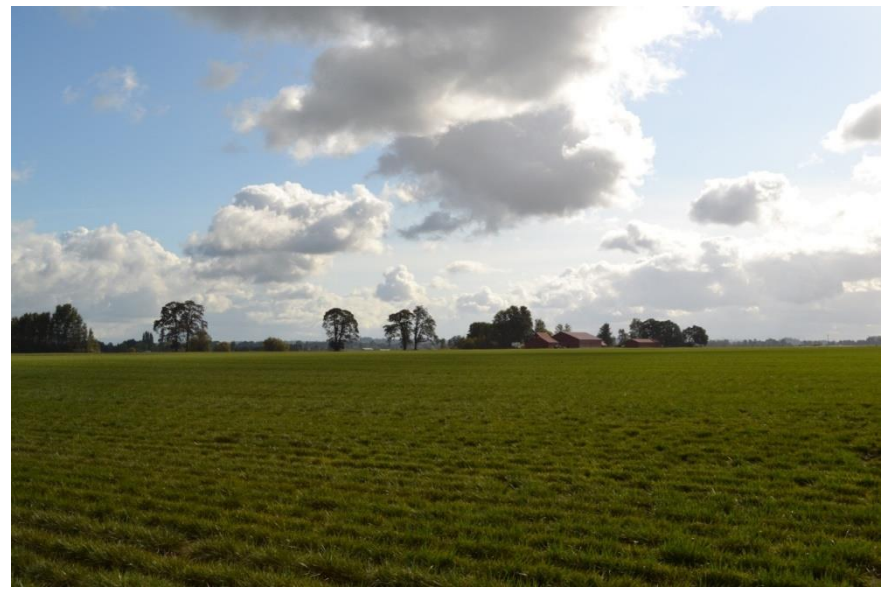
WOODLAND BOTTOMS, COWLITZ COUNTY, WASHINGTON

Policies can be developed to direct growth away from farmland and encourage agricultural activity. Development regulations and incentives can create policies intended to protect farmland. Planners can monitor land use and participate in research and studies related to agriculture in their region. Geographic Information Systems (GIS) is an important tool that planners can use to