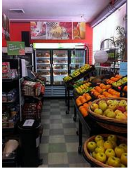
STORE PARTICIPANT FROM SEATTLE-KING County Public Health's Healthy Food Here Program

An increasing number of Comprehensive Plans now provide policy guidance on healthy living and access to healthy food. These policies are translated into implementing regulations through zoning codes such as permitting urban farming, allowing farmers markets as